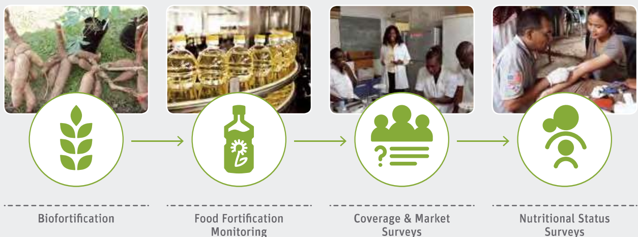
FIGURE 3: Application areas along the food value chain