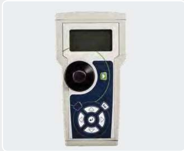
FIGURE 1: iCheck device and reagent vial