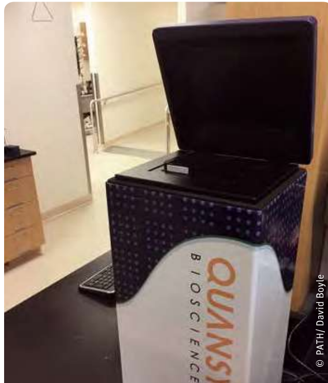
The Q-Plex™ Human Micronutrient Array can simultaneously measure up to seven biomarkers for vitamin and mineral status in a sample of human serum derived from a finger-stick.